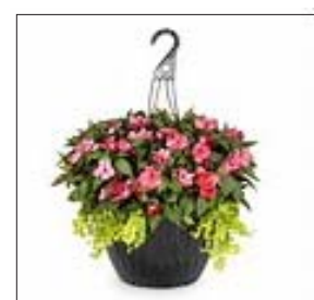
Sunpatiens, 10" Hanging Basket, Pink, Purple, Mixed, $18 each