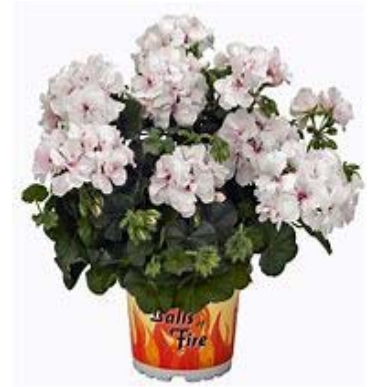
Geranium 4 1/2" pots, Red, Salmon, Violet, White, 8 pots per flat, $30 each