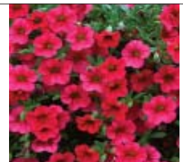
Million Bells, 10" Hanging Basket, Blue, Yellow, Red, $18 each