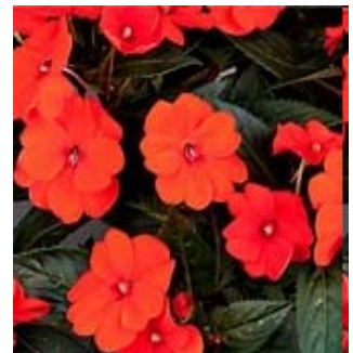
Sunpatien® 4 1/2" pots, Pink, White, Red, Orange, 8 pots per flat, $30 each