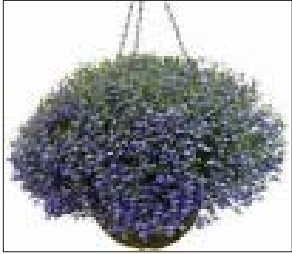
10" Hanging Basket Lobelia, blue, $18