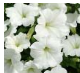
Wave Petunia, 4 1/2" pots, Pink, Blue, White, 8 pots per flat, $30 each