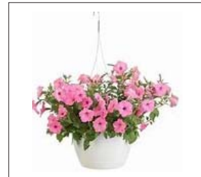
Wave Petunia, 10" Hanging Basket, Coral, Blue, Pink, $18 each

Boston or Fluffy Ruffle Fern 10" Hanging Basket $18