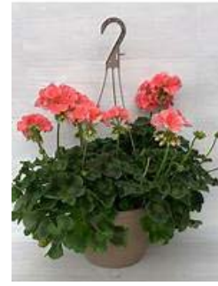
Ivy Leaf Geranium, 10" Hanging Basket, Red, Lavender, Salmon, $18 each