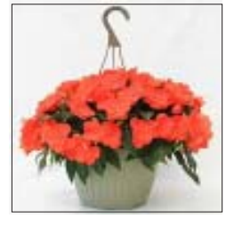
New Guinea Impatiens, 10" Hanging Basket, Pink, White, Purple, Salmon, $18 each