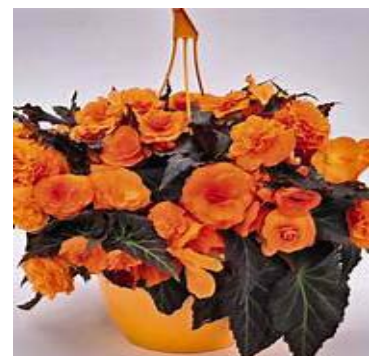
Begonia Non-Stop 10" Hanging Basket, Red, Yellow, Orange, $18 each